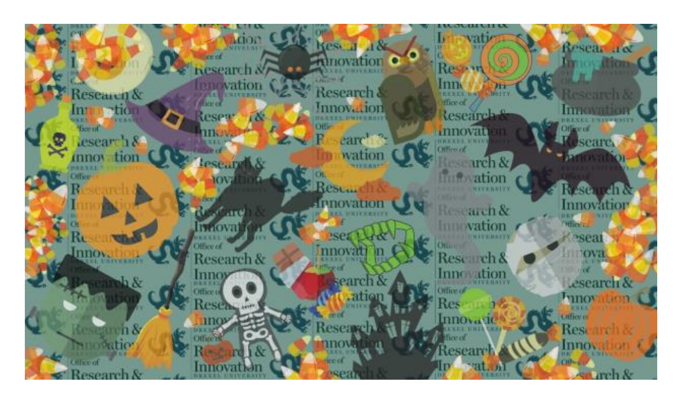
Office of Research & Innovation Newsletter · October 2020